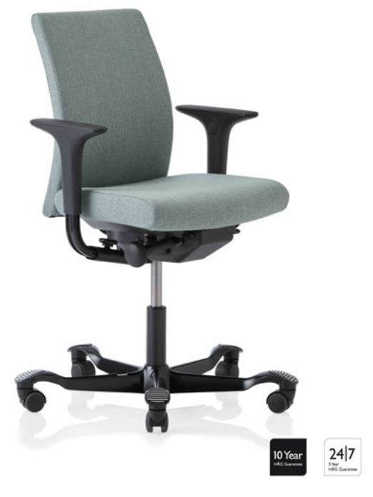
Design: Peter Opsvik. Patent- and design protected.